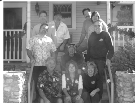
Historical Society Elves at Martin House

Merry Christmas! We hope you have a holiday that fills your heart with joy!