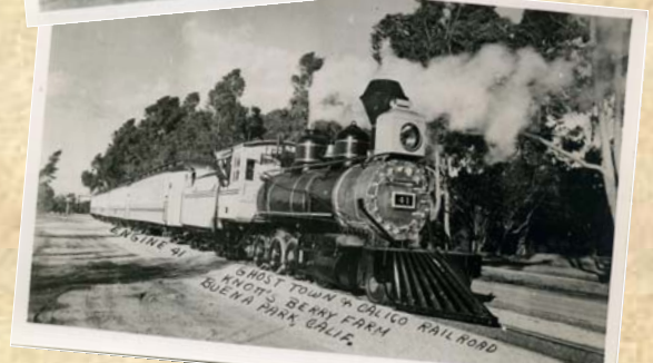
ENGINE #1 GHOST TOWN & CALICO RAILROAD KNOTT'S BERRY FARM BUENA PARK, CALIF.