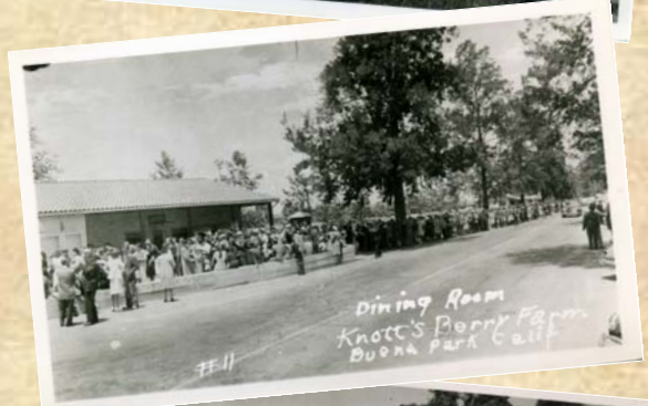
Dining Room Knott's Berry Farm Buena Park, Calif.